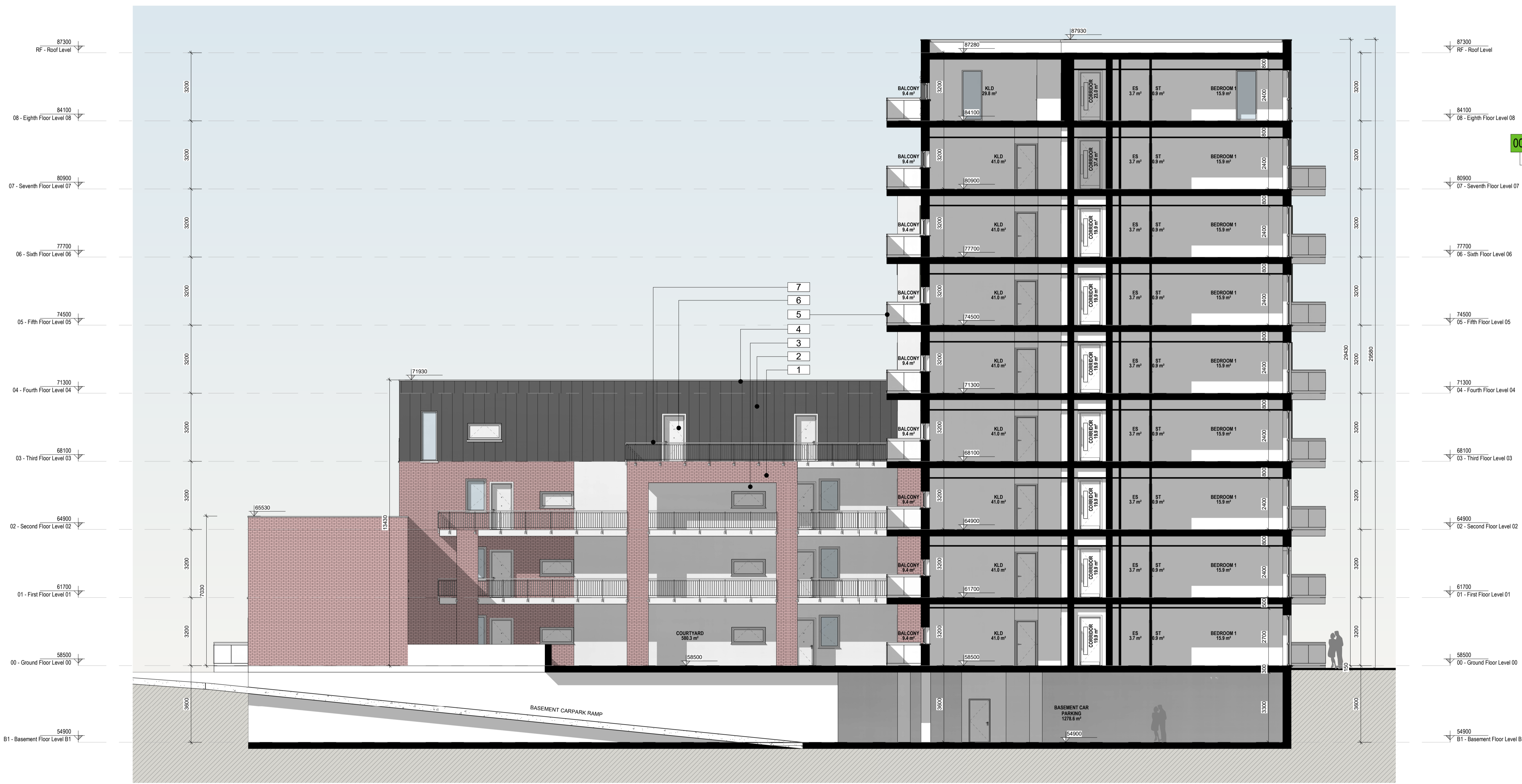
1 Courtyard South Elevation 1 : 100

Please consider the environment before printing this sheet